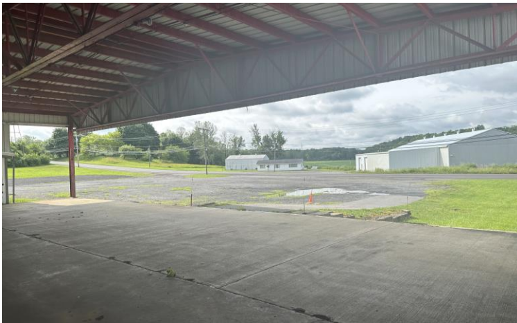
Covered dock area