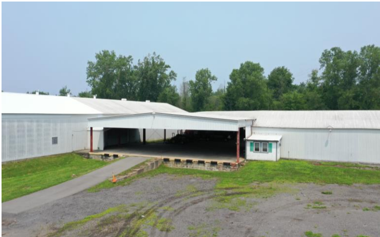
Loading docks and drive-in