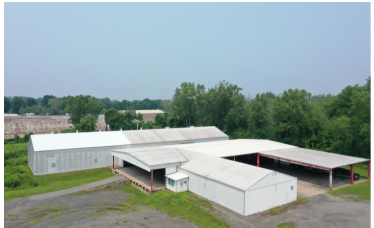
View facing west