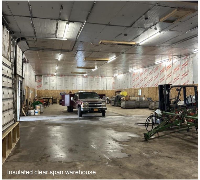
Insulated clear span warehouse