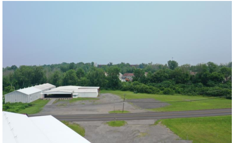
Large yard space and frontage on Route 104